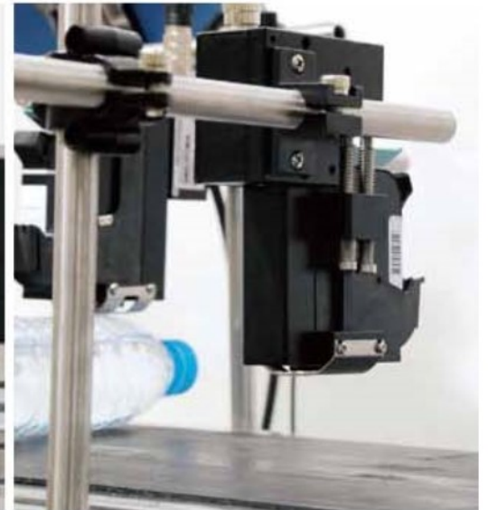
Elfin VIC Uneven Surface Inkjet Printer