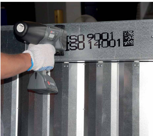
Prints on steel with black universal ink

EBS Ink-Jet revolutionized hand-held coding when we introduced the HandJet EBS-250. Now our next-generation HandJet EBS-260 model provides reimagined features and functionality for even more innovative, portable coding.