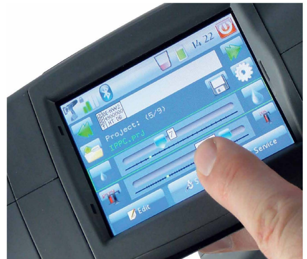
Control and input via touchscreen

Among its many software innovations, the HandJet EBS-260 features a patent-pending function that measures the product or package to be imprinted. By simply scrolling the width of the object, the unit automatically calculates the available printing area and adjusts the size of the saved text to fit the space.