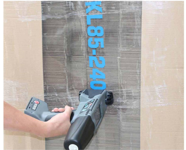
Prints on stretch wrap with pigmented ink

In addition, the HandJet EBS-260 makes available a number of practical accessories to maximize the function of the unit. These include print stabilizers, guide wheels, scanners, handy carry bags and holsters, and a growing number of added options.