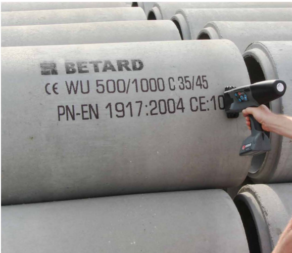
Prints on concrete with special UV-resistant black ink