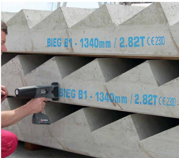
Also prints on concrete with blue pigmented ink